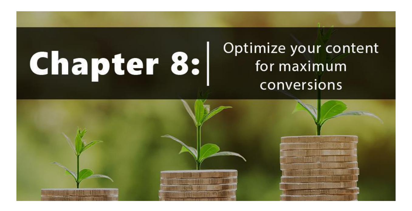
Chapter 8 - Optimize your content for maximum conversions

In the previous chapter, we optimized our whole system. In other words, we optimize the squeeze page, the sales page or the other pages that lead to actual dollars showing up in your bank account.